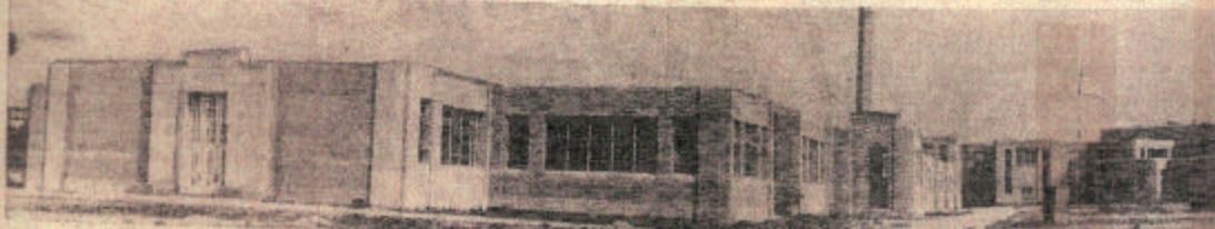
THE CHICAGO VOCATIONAL SCHOOL, EIGHTY-SEVENTH ST. AND ANTHONY AV., WHICH WILL